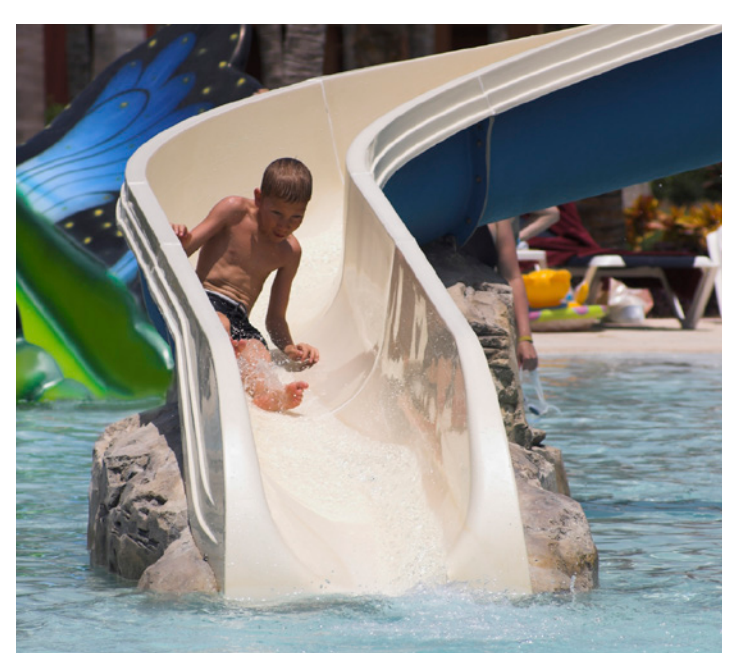
This slide exit is almost too vertical. A participant coming down head first could hit the concrete bottom.